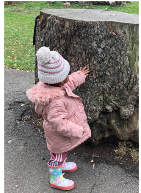
Beginning to appreciate nature - This shows children's curiosity in their surroundings