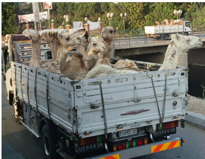
These "Ships in the desert" - near Luxor, Egypt, will end their days in an abattoir for their meat and bones. Oh dear!.