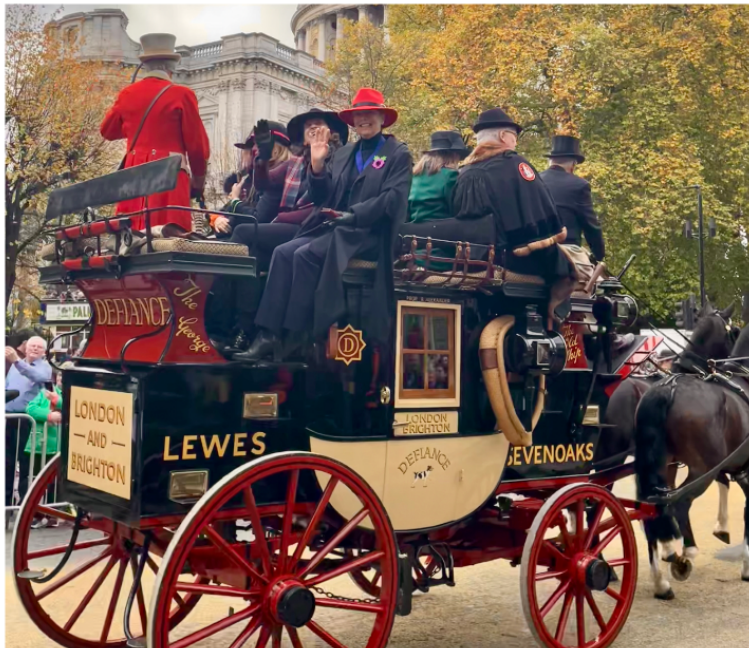
Days Gone By - Dickens's "Pickwick Papers" has stories of coach travel to these places

All the photos entered were of a very high standard.