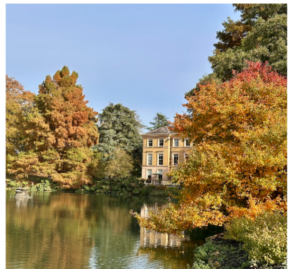
In Kew Gardens a beautiful house and gardens. Seems so elegant.